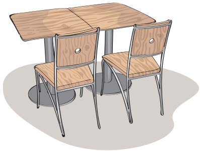
Wooden and laminate furniture