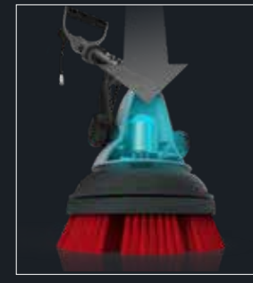
UNSTOPPABLE Withstands over 7kg /

19.7cm / 7.75" head height with medium brush