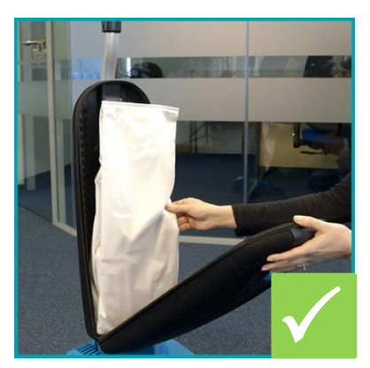
Unzip the bag compartment and check the vacuum bag is fitted.