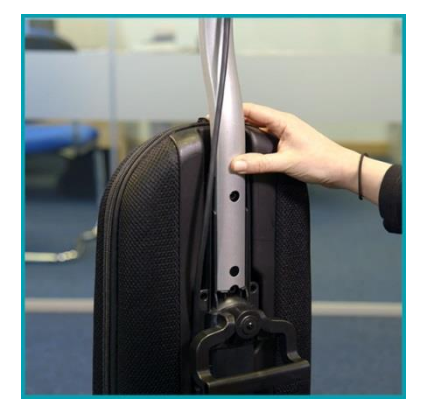
Place the handle onto the back of the vacuum, aligning the holes.