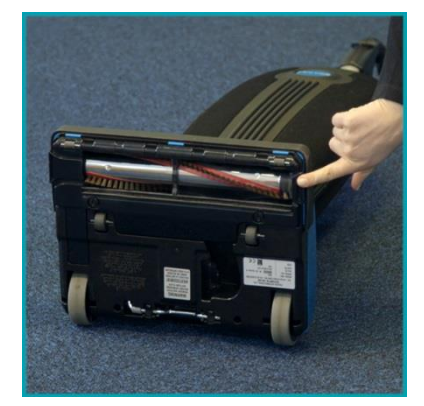
For maximum edge cleaning, place the left side of the nozzle, from the user's perspective, against the wall or stationary furniture to use the edge cleaning feature.