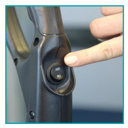
To replace the vacuum bag, ensure the machine is switched off and unplug from the charger.