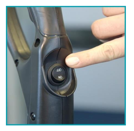
Ensure the machine is switched off.