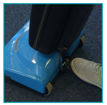
To recline the vacuum press the handle release pedal located on the back of the vacuum with your foot to recline the handle.