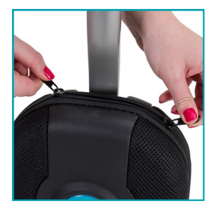
Unzip the bag compartment.