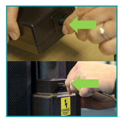
To charge the battery plug the AC cable into the charger and plug the DC cable into the charge point on the battery.