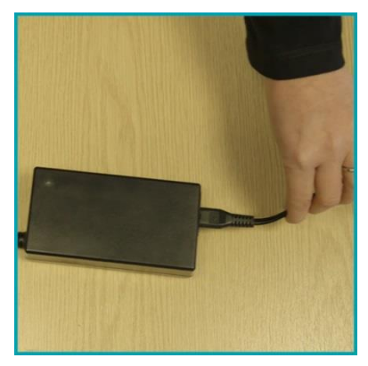
After every use check the battery cable for any wear or damage, check the dust bag and if full replace. Check the battery charge status and charge if required.