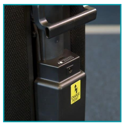
Always unplug the charger from the charger point before using the vacuum.