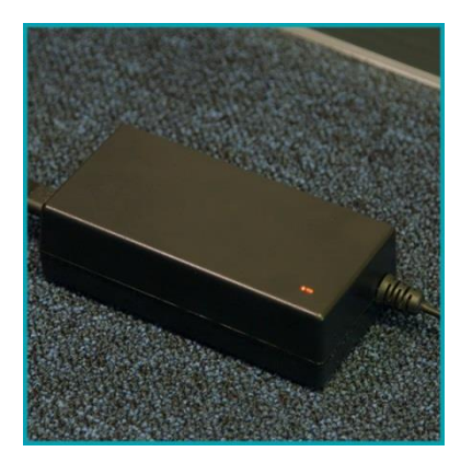
The charger LED light will be red during charging and will turn green when the battery pack is fully charged.