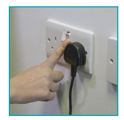
Then plug into the wall socket.