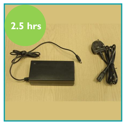
When the machine arrives, place the machine on full charge for first use. This will take approximately 2.5 hours.