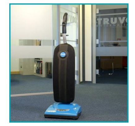
Store the machine in a dry indoor area only.