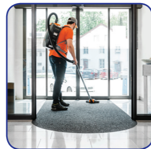
Cinema and opera