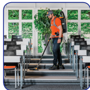
Congested areas such as classrooms