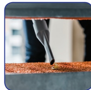
Quick problem solver