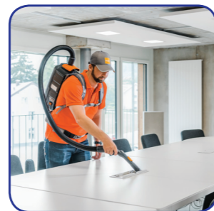
Office flow/spot cleaning